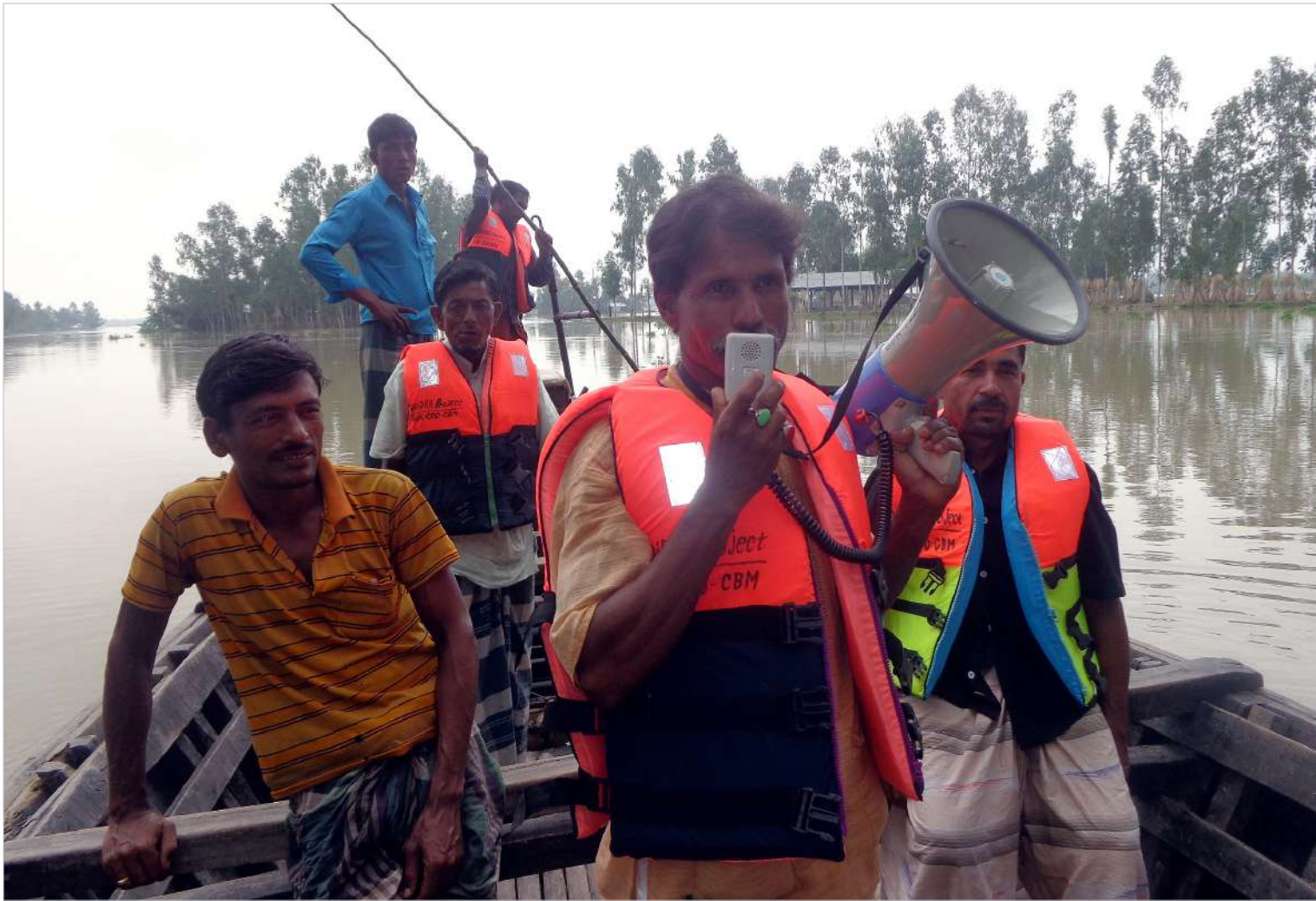
Evacuation in process in Bangladesh.

certainly not with persons with disabilities. Though in some cases specific attention is given to households with disabled persons, such interventions are rare. Moreover, such an approach only addresses accessibility of the house and not the wider societal context in which the person lives. Although an admirable start, such restrictive approaches fall short of achieving the vision of “building back better.”