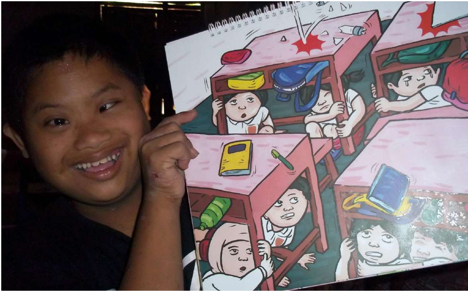
Indonesia: Building resilience for children with disabilities. Disaster Risk Reduction training has to include all members of society, especially the most vulnerable.

unable to find, count, assess, or communicate with persons with disabilities. If DRM personnel do not see any persons with disabilities, it can lead to the assumption that “there are no persons with disabilities,” or that “all persons with disabilities must have died,” excluding persons with disabilities from DRM activities, including relief and recovery efforts.