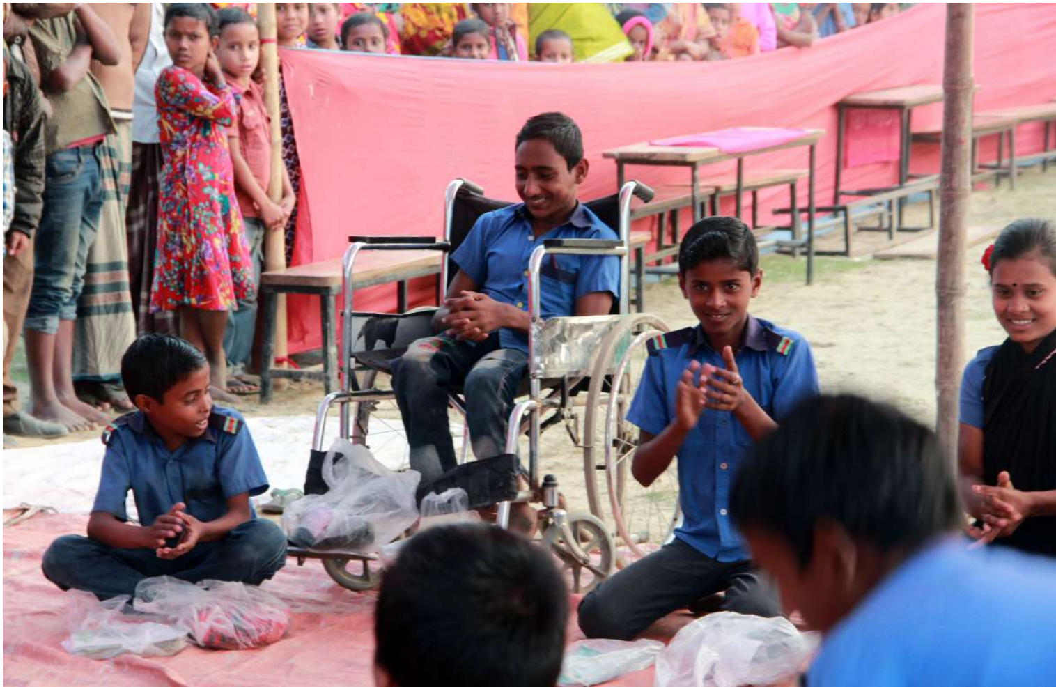
Children participate in a mock drill.

ENHANCE staff expertise. In addition to consultations with the World Bank’s Global Disability Advisor as appropriate, and ensuring that there is a corps of staff available for internal “just in time” consultation (including staff with disabilities), guidance notes and other training, information, and professional development tools should be made available to guide staff in ensuring that DRM-related projects incorporate disability from the earliest phases onwards.